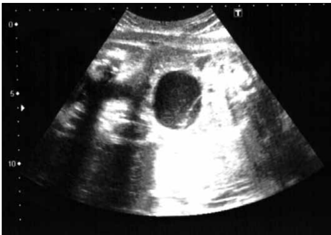
Figure 1. The ultrasound finding of ovarian cyst with a diameter of 41x33 mm at 33 weeks gestation

The incidence of foetal ovarian cyst is uncertain but has been estimated at 1 in 2.625 pregnancies (8). The increased use of routine USG has led to the earlier detection of foetal ovarian cysts. The first case detected by USG was reported in 1975 (9); the earliest case was described in the 19 th week of gestation (10). Most cysts are small and involute within the first few months of life.