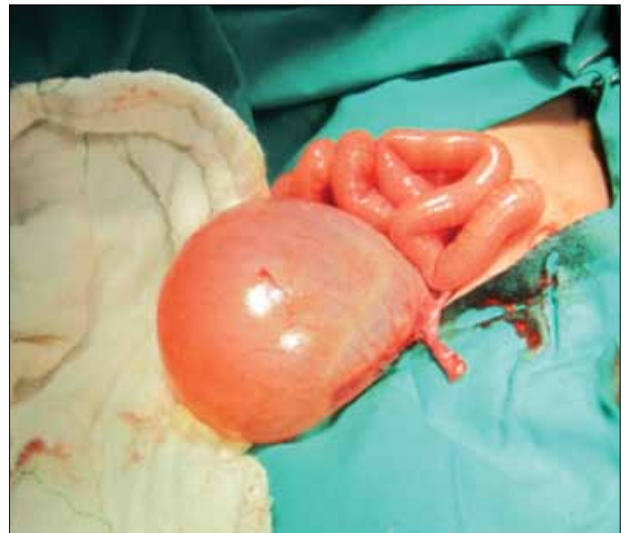
Figure 2. Intraoperative appearance of cyst

Foetal ovarian cyst are classified according to ultrasonographic criteria into two groups: simple (uncomplicated) and complex (complicated) (11). The characteristics of ultrasonographic appearance of simple cysts are the following: unilocular, anechogenic, round, small size (often <5 cm), unilateral or seldom bilateral and thin-walled. Complex cysts on the other hand