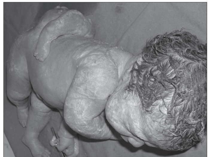
Figure 2. Postnatal final diagnosis of case 3 as pygopagus tetrapus parasitic twin