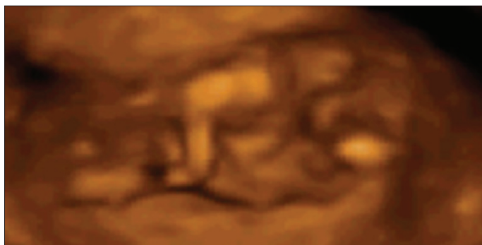
Figure 3. 3D image of case 3 with omphalopagus

that had undergone incomplete division of the embryonic cell mass (4). Embryologic studies have shown that this extraordinary anomaly could develop from fusion of the two separate embryonic discs. Conjoined twins are classified according to the site of fusion and are always joined at identical anatomic points (Table 1). The combination of different types can occur, but the most frequently seen types include thoracopagus (20-40%), omphalopagus (18-33%), and parapagus (28%). Rachipagus is the rarest type of conjoined twins with an incidence of approximately 2% (8, 9).