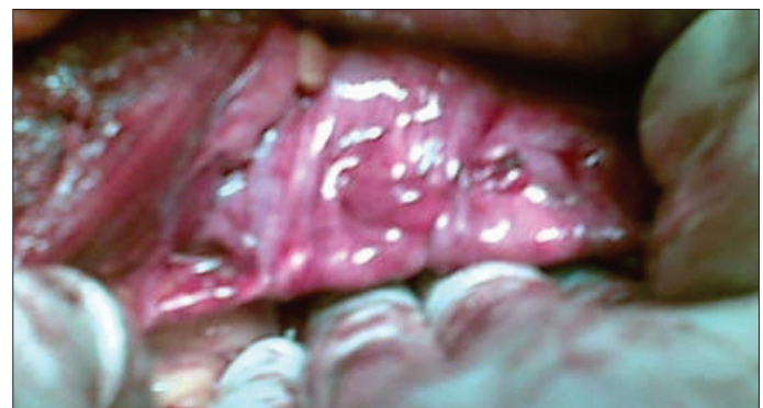
Figure 3. Pulled-up vault after repair with retroperitoneal rectus fascia strips

were not very serious: 3 cases had omental and 1 had small gut adhesions on the vault. Amount of intraoperative blood loss was between 200 to 450 ml (more loss in cases where perineorrhaphy was also done); nevertheless no blood transfusion was required in any of the cases either intra-op. or post-operatively. In the post-operative period, one patient (3.7%) had vomiting on the 2 nd day, another (3.7%) had fever. 33% (n=9) of patients felt