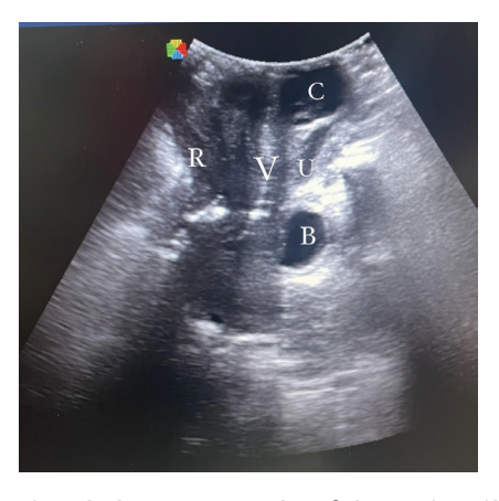
Figure 2. Perineal ultrasonography of the patient illustrating the round-shaped, superficial, cystic structure located inferior to the symphysis pubis. Translabial soft tissue rendered grayscale image demonstrates a mid-sagittal view of the cystic mass, which has no communication with the distal urethra. The mass clearly distorts the position of the urethral meatus

B: Bladder, C: Cyst, R: Rectum, U: Urethra, V: Vagina