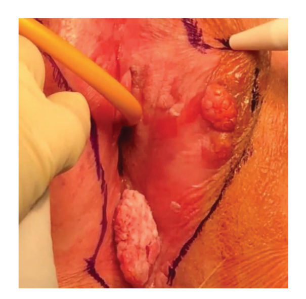
Figure 1. Vulvar lesion

Bilateral inguinal lymph nodes were detected both by gamma probe and NIR/ICG (Figure 2, 3). After sentinel lymph node removal, vulvectomy was performed. The post-operative course was unremarkable.