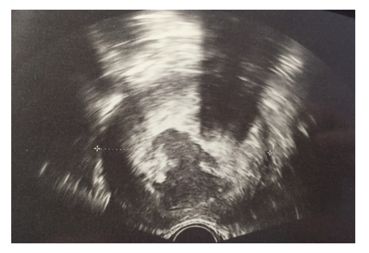
Figure 1. Transvaginal ultrasound showing the sagittal diameter of the fundus of the uterus and the size of the tumor. Inhomogeneous appearance, central hypoechoic area, degenerative cystic changes atypical for myoma suggesting necrosis

A group of patients with uterine myoma selected from all of those who underwent hysterectomy or myomectomy were matched by age and type of operation (4:1 ratio) during the same period. Patient characteristics and the indication for surgery were analyzed. Preoperatively, all patients were examined by experienced gynecologists on the basis of German guidelines (13). Preoperative ultrasound parameters (14), such as size of the tumor, anechoic areas suggesting necrosis (Figure 1), solitary growth, increased vascularization (Figure 2), an irregular lining, and endometrial thickness >5 mm in postmenopausal patients were taken into account. Ultrasound was performed within four weeks before surgery, and ultrasound characteristics of patients with uterine sarcoma were compared with those of controls with uterine myoma.