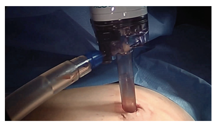
Figure 2. A blunt 11 mm laparoscopic trochar is utilized to make the entry into the abdominal cavity, in order to avoid a sharp dissection into the abdomen which would result in a larger fascial footprint

incision and a much larger fascial footprint, we then place an 1 mm blunt laparoscopic trochar (Figure 2) into the incision after insufflating with a veress needle. The multiport device is then loaded into its introducer, (Figure 3) and is inserted into the abdominal cavity after removing the 11 mm port from the umbilical incision (Figure 4). The multiport device can then be installed and actively utilized to perform the hysterectomy through only an 11 mm incision (Figure 5). Following this, the uterine pedicles are divided with a bipolar power coagulation and division device, and the circumferential colpotomy is made with a monopolar cautery set to 30 watts of coagulating current with a laparoscopic hook extender. The vaginal cuff is sewn from the vaginal approach and ovaries and tubes are removed after removal of the uterus. The patient returned foru weeks post-operatively and no scars were visible (Figure 6). We believe this technique to be significantly different from any