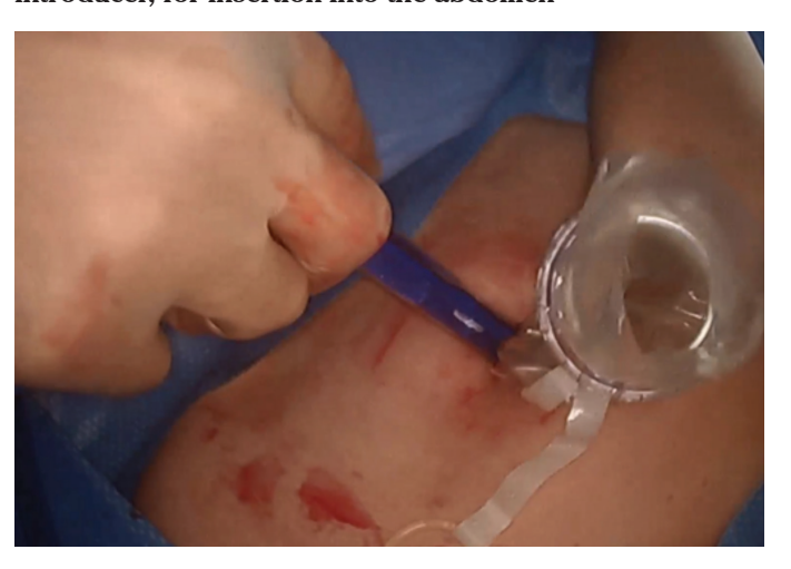
Figure 4. The multiport device is inserted through the abdominal incision after withdrawing the 11 mm blunt trochar. This ensures the incision width will not exceed 11 mm and has been created by blunt entry, which further decreases the chance of postoperative hernia