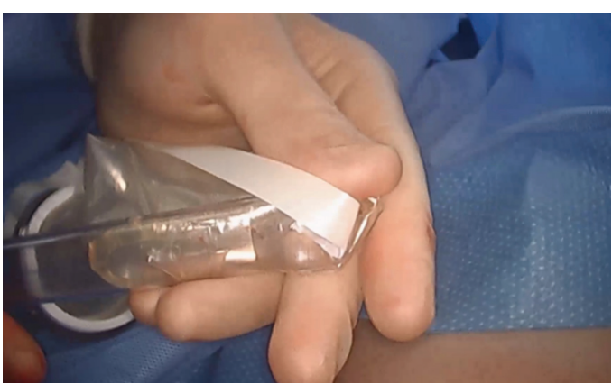
Figure 3. A multiport device is then loaded into the introducer, for insertion into the abdomen

incision and a much larger fascial footprint, we then place an 1 mm blunt laparoscopic trochar (Figure 2) into the incision after insufflating with a veress needle. The multiport device is then loaded into its introducer, (Figure 3) and is inserted into the abdominal cavity after removing the 11 mm port from the umbilical incision (Figure 4). The multiport device can then be installed and actively utilized to perform the hysterectomy through only an 11 mm incision (Figure 5). Following this, the uterine pedicles are divided with a bipolar power coagulation and division device, and the circumferential colpotomy is made with a monopolar cautery set to 30 watts of coagulating current with a laparoscopic hook extender. The vaginal cuff is sewn from the vaginal approach and ovaries and tubes are removed after removal of the uterus. The patient returned foru weeks post-operatively and no scars were visible (Figure 6). We believe this technique to be significantly different from any