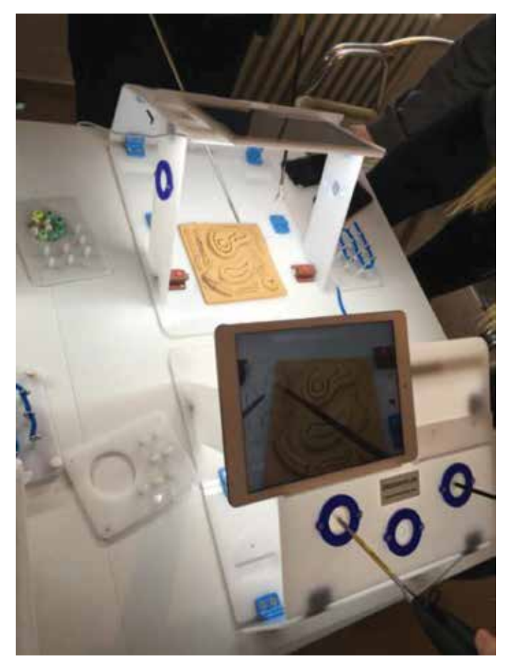
Figure 1. Structure of the laparoscopy simulator

The aim of this study was to measure the influence of manual training on the knotting time of medical students, as part of the practical clerkship in gynaecology and obstetrics. A classic box trainer working with a tablet camera was used and manual exercises were carried out in a defined sequence. Figure 1 shows the box trainer.