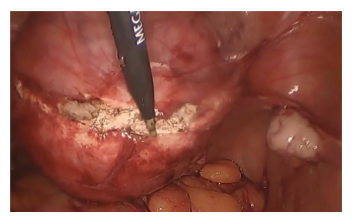
Figure 1. Initial dissection into the cervical stump is started in a linear pattern in order to maximize the distance from both the bladder and the rectum

Figure 2. A 5 mm laparoscopic, sharp-tooth tenaculum is inserted vaginally in order to grasp the cervix and hold tension against the manipulator. This allows the manipulator to be pushed cephalad while completing the colpotomy. The resulting force pushed the ureters laterally, minimizing the risk of ureteral injury