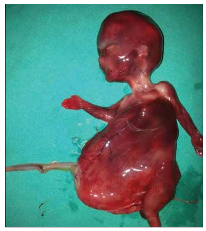
Figure 4. The fetus after termination of pregnancy

Enlarged bladder in 45 minutes during an examination can be used to diagnose for megacystis in the second and third trimester (1). In the second and third trimester, lower urinary tract obstruction (LUTO) frequently can be caused by posterior urethral valve