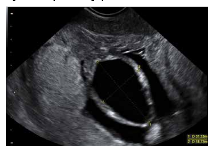
Figure 3. Bladder measured 31x18 mm at twelfth week of gestation Answer

Ultrasound examination revealed a fetal part near the anechoic