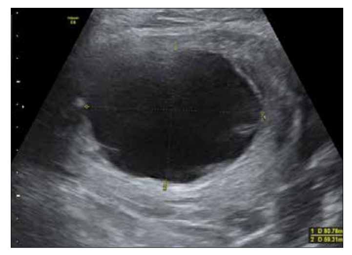
Figure 1. Cystic mass in the uterine cavity

A patient who was 30 years old was referred to our clinic at the 16^{th} week of gestation. It was her first IVF pregnancy. Ultrasonographic examination showed an anechoic image that measured 80x59 mm (Figure 1). What is your diagnosis?