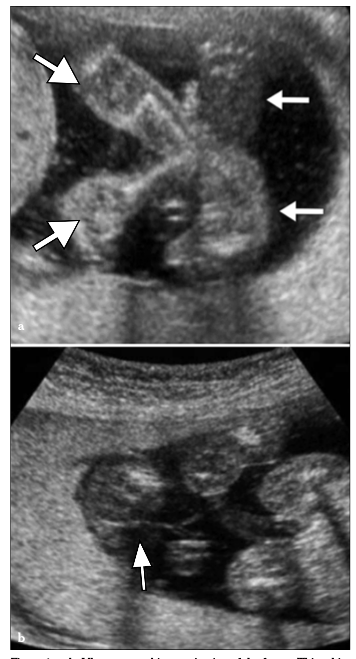
Figure 1. a, b. Ultrasonographic examination of the foetus. Thin white arrows show the deformed foetal feet. Thick white arrows identify the foetal lower limbs (a). White arrow indicates the amniotic band (b)

At the 20<sup>th</sup> week, the pregnancy was terminated. In the postpartum evaluation of the foetus, constriction rings were observed around both lower limbs above the ankles and distal to this, the extremities were swollen and oedematous. It was also observed that all of the digits of the right hand and only two digits of the left hand were amputated (Figure 3). Further pathological examination could not be performed since the family did not consent to an autopsy due to their religious beliefs.