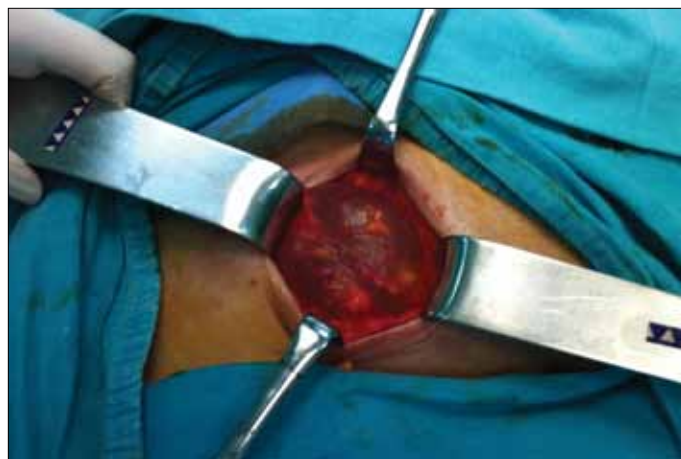
Figure 3. Intraoperative appearance of cyst

comma-shaped cyst with a tail directed cranially toward the inguinal canal, measuring 6.4x4.8 cm (Figure 1). There was no vascularity seen in the wall of the cyst on colour Doppler examination. Coronal and axial MR showed a thin walled cystic mass (Figure 2). Considering the clinical symptoms and examination findings, the patient underwent surgical exploration through a lower groin incision. Surgical exploration confirmed the cystic lesion with the patent, fluid-filled canal and the round ligament with a cystic mass was excised (Figure 3). What is your diagnosis?