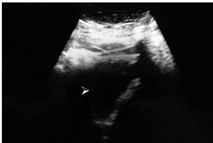
Figure 1. Ultrasonographic appearance of cyst

A 30 year-old female was referred to our hospital with a painless mass of the right inguinal area. The swelling was initially small but gradually increased in size over a period of 10 months. There was no history of trauma, gynaecological problems or previous surgery. On physical examination, a 7x6 cm, rounded, mobile, irreducible swelling was detected superficially in the inguinal area. The volume of this mass increased in standing position, and could be slightly reduced by manual compression. There was no pain on palpation and cough impulse was absent. Sonography was carried out with the patient in prone position. The mass was a