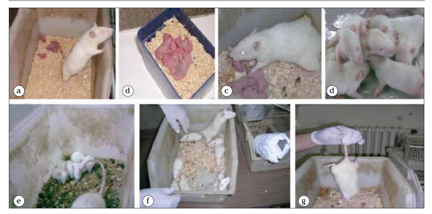
Figure 1. The follow up period of rats for six weeks a) after delivery, b) one week old, c) two weeks old, d) three weeks old, e) four weeks old, f) five weeks old, g) at the end of sixth week

No significant difference was observed between the pups in control and nicotine groups for a period of six weeks (p>0.05 each week)