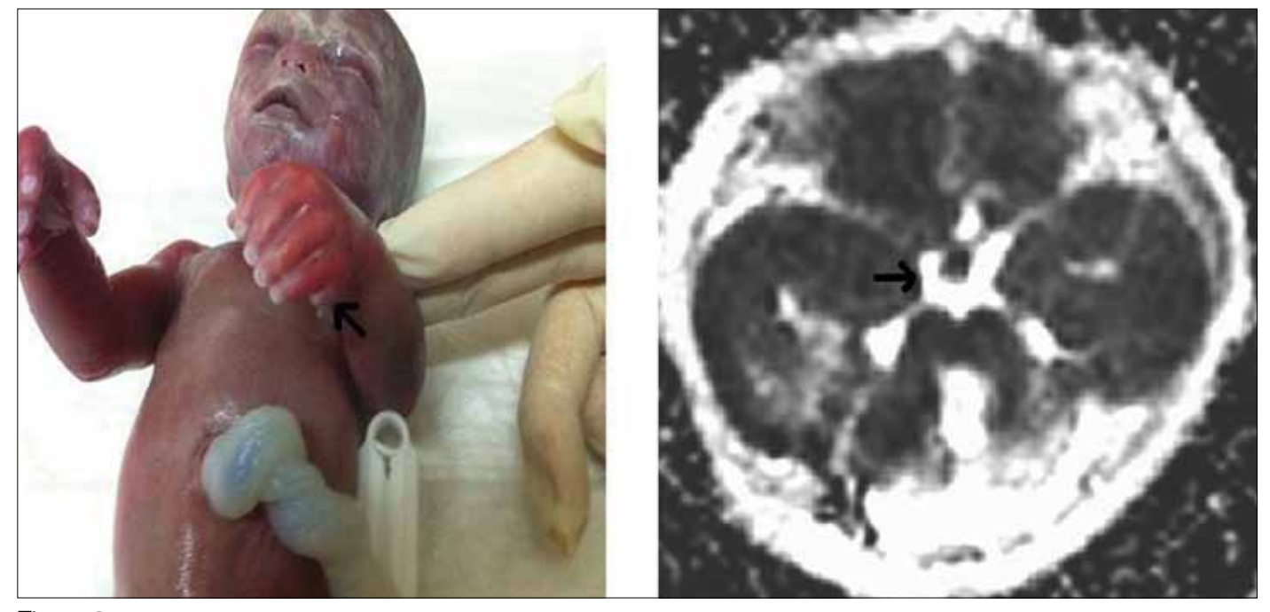
Figure 3. Polydactyly in both hands demonstrated in the photograph of fetus following abortion (left). Axial postnatal MR image demonstrating the "molar tooth appearance" (right)

Due to the marked heterogeneity in this group of disorders and the relatively high frequency of associated medical condi-