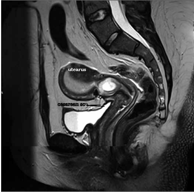
Figure 2. MRI imaging of cesarean scar pregnancy