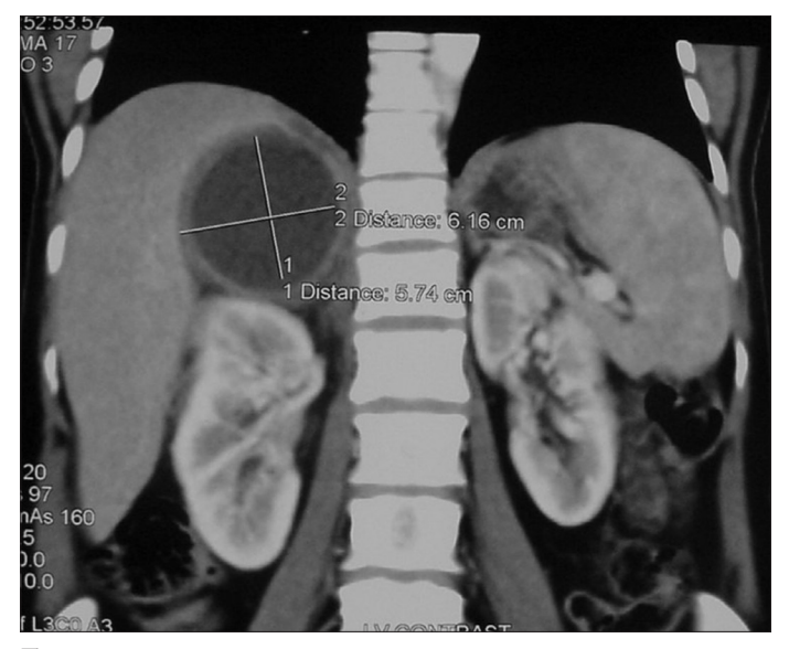
Figure 3. Adrenal Cyst on follow up scan