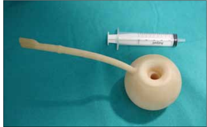
Figure 2. The truth is this cyst is an inflatable pessary

America. We thought that somehow in USA a pessary had been inserted for her pelvic organ prolapsus and after time it was totally forgotten. With this case, the importance of the physical examination and history was revealed once more.