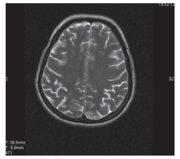
Figure 1b. The follow-up image obtained four weeks after delivery which shows that the abnormalities have disappeared

Hypertension associated with fluid overload in patients with an altered blood-brain barrier best explains the acute, reversible white-matter changes that characterize PRES. In a healthy subject, cerebral autoregulatory mechanisms that have both myogenic and neurogenic components maintain constant brain perfusion (9). The effectiveness of the neurogenic component of autoregulation is directly proportional to the degree of sympathetic innervation. To maintain constant cerebral blood flow, cerebral vasoconstriction occurs in response to hypertension,