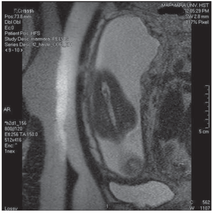
Figure 6. MRI of the fetal spine in Case 2. The bony spur in the lumbosacral junction

diastematomyelia. Fetal MRI was not further performed since the diagnosis of open spina bifida was excluded due to the abovementioned ultrasonographic criteria and normal maternal serum AFP levels.