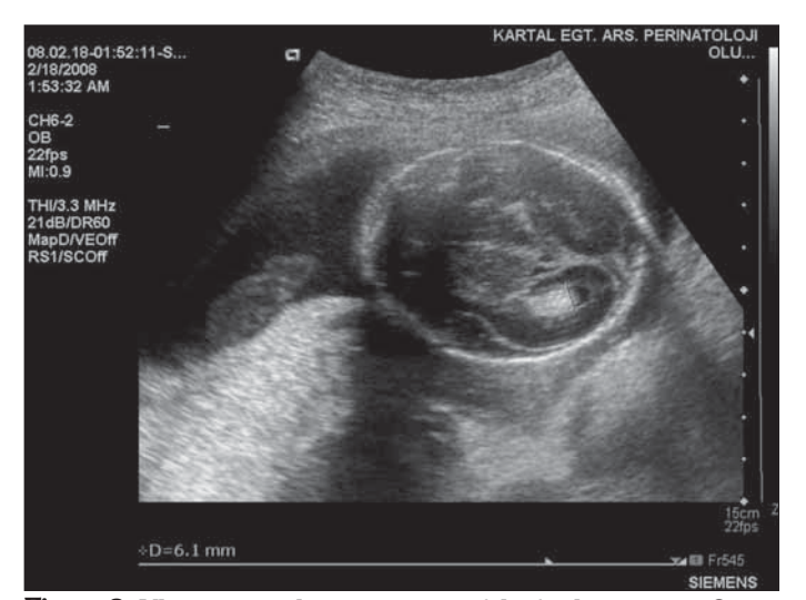
Figure 2. Ultrasonographic appearance of the fetal cranium in Case 1

on the affected segment. The baby underwent an operation for correction of the tethered cord at the age of three months. Currently, she is eight months old having no neurological sequelae.